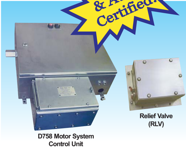
D758 Motor System Control Unit