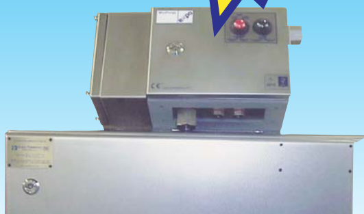
Mini-X-Purge Control Unit